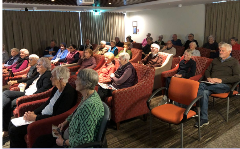
(Above) Residents of Meadowbank Village attending the Hearing Health Morning Tea.