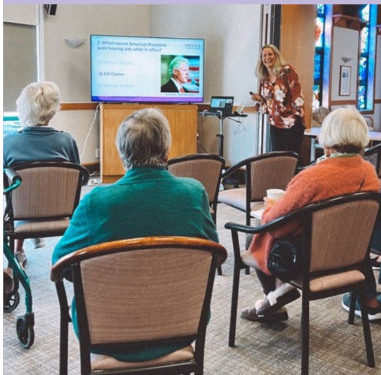
(Above) NFDHH presenting Hearing Health Morning Tea at Lady Allum Village.

It’s stories like these that inspire Oceania and NFDHH to continue delivering their meaningful mahi.